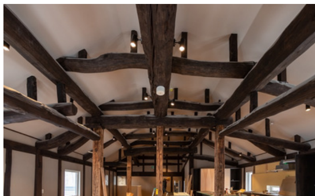
The frame rebuilt in Niseko — re-engineered to full modern building code specification.