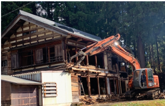
The farmhouse dismantled piece by piece — every timber catalogued for restoration.