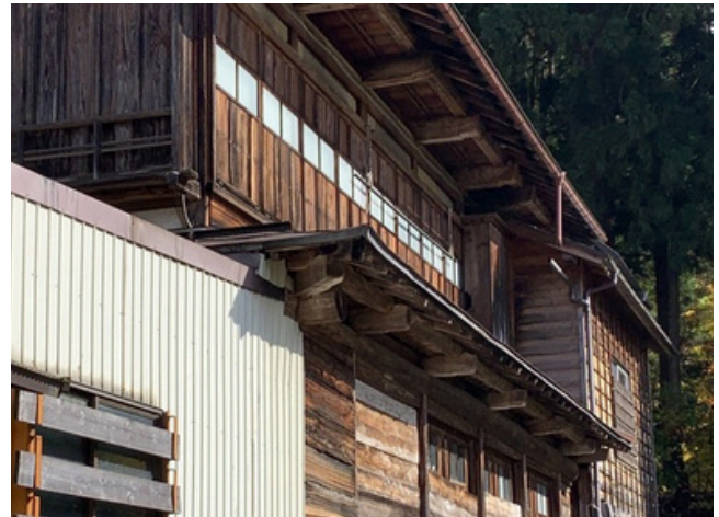
The farmhouse as it stood in Niigata National Park, c.1880s, prior to dismantling.

“Not a modern building with a Japanese aesthetic. The real thing.”